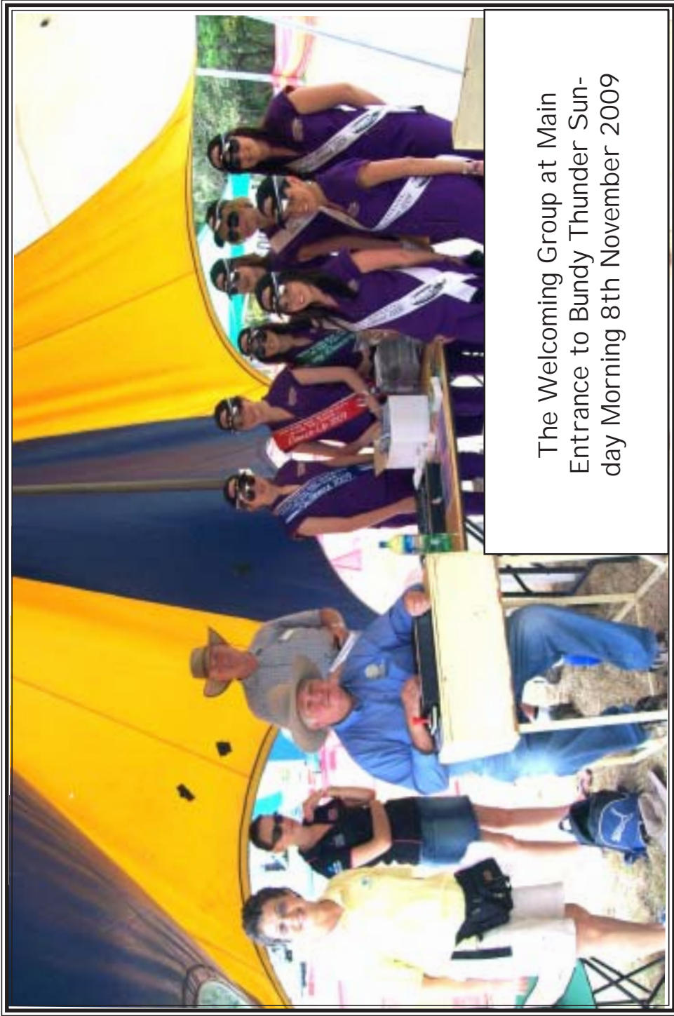
The Welcoming Group at Main Entrance to Bundy Thunder Sun- day Morning 8th November 2009